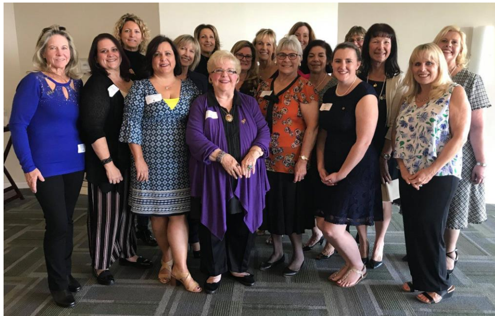
Alumnae Membership...there's a place for everyone!